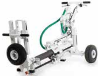
Minnich A-1-Series $170/Day $510/Week $1530/Month