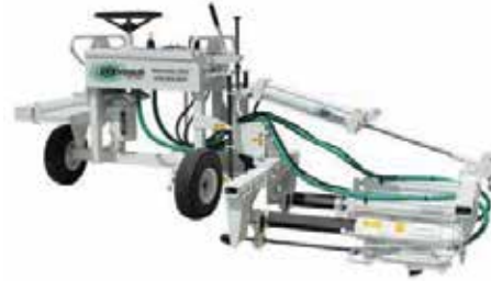
Minnich A 2C $260/Day $780/Week $2340/Month