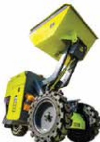
Ecovolve ED1500 $275/Day $825/Week $2475/Month