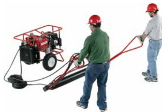
Allen Roller Tube Finisher $250/Day $750/Week $2250/Month

Strikes off concrete fast and accurately. Perfect quick strike finisher for paving - especially for pervious concrete applications. Comes with choice of tube size - 6', 8', 14', 16', 18' and 26'.