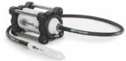
Handheld Vibrator $60/Day $180/Week $540/Month