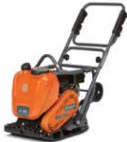
Husqvarna LF80 LAT $105/Day $315/Week $945/Month

LF 80 LAT is a lightweight, fast-operating forward plate compactor, designed for efficient compaction of soil and asphalt. It is ideal for repair jobs and maintenance work, such as driveways and parking lots. The large water tank features an oversized cap to enable less frequent and faster refills. It is easy to clean, leaves no marks on the pavement and uses whatever water is available on-site.