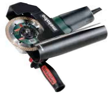
5" Grinder with Tuckpointing Shroud $40/Day $120/Week $360/Month

FEIN SuperCut is the right power tool for all professionals in the interior and renovation trades. With a 400 Watt motor and stronger oscillation movement, the FEIN Supercut means maximum progress, resulting in time and cost savings. Blade not included.