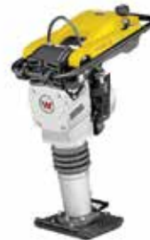
Vibratory Rammer $90/Day $270/Week $810/Month