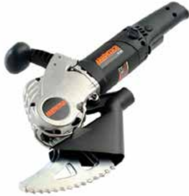
Arbortech Brick and Mortar Saw $90/Day $270/Week $810/Month

The AS170 Brick + Mortar Saw represents a revolution in cutting technology. Using a unique patented orbital cutting motion with two forward facing blades that combine to perform both a hammering and cutting action. Blade not included.