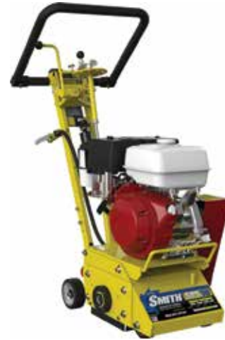
Smith 10" Gas Powered Scarifier SPS10 $395/Day $1185/Week $3555/Month

The SPS10 is available with the most cutter tools and accessories to tackle every type of surface preparation and removal job on asphalt, concrete, steel or wood surfaces.