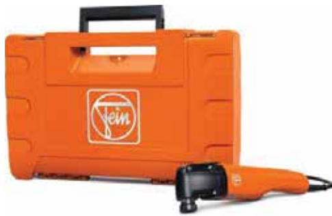
Fein MultiMaster Tool $45/Day $135/Week $405/Month

The Husqvarna Handheld Core Drill is a core drill for drilling up to 4in. diameter openings. The unit can be used for a variety of applications including making holes for ventilation, plumbing pipes, joints, electrical sockets and telecom cables. For use with DR15 and hand-held core bits. Core bits are not included.