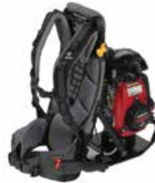
Backpack Vibrator $65/Day $195/Week $585/Month