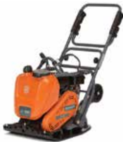
Husqvarna LF100 LAT $125/Day $375/Week $1125/Month

The LF 100 LAT is a fast-operating forward plate compactor, designed for efficient compaction of asphalt and soil. It is ideal for repair jobs and maintenance work, such as driveways and parking lots.