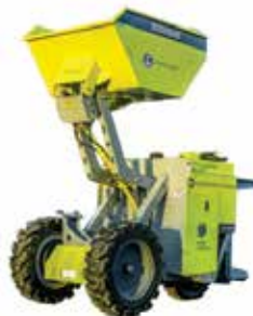
Ecovolve ED1000 $250/Day $750/Week $2250/Month