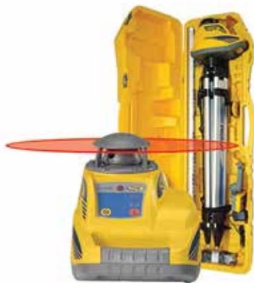
Spectra HV101 Laser Kit $70/Day $210/Week $630/Month

Robust tuck pointing system with dust extraction for quick removal of mortar joints.