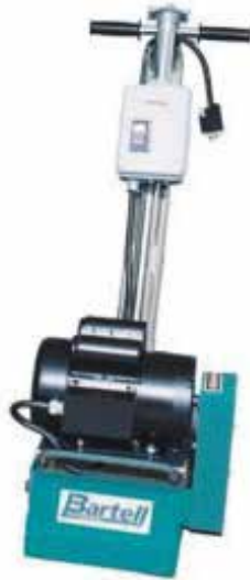
Bartell (Electric) Scarifier SP8-E $305/Day $915/Week $2745/Month

For any surface, for any coating, the SP8 performs with great versatility. It offers high speed, accurate surface preparation at an economical price.