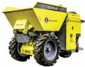
Ecovolve ED800 $225/Day $675/Week $2025/Month

The electric dumper is perfect for use where operating levels must be low while the compact size and small turning circle means the ED can go where others can't.