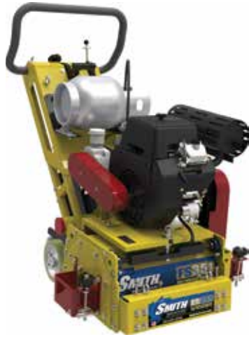
Smith 15" Propane Powered Scarifier FS351LP $475/Day $1425/Week $4275/Month

Lockable depth-control settings for consistent removal in the "impact zone," up to 2x faster removal speeds with adaptable changes for diamond shaving, rototrans or carbide scarifying, re-designed vacuum pickup location to contain debris.