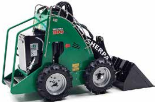
Sherpa 100 ECO $350/Day $1050/Week $3150/Month

Electric mini skid-steer suitable for indoor demolition work. Battery pack that power the unit for up to 7 hours.