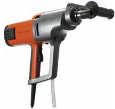
Husqvarna Hand Held Core Drill $50/Day $150/Week $450/Month

The AS170 Brick + Mortar Saw represents a revolution in cutting technology. Using a unique patented orbital cutting motion with two forward facing blades that combine to perform both a hammering and cutting action. Blade not included.