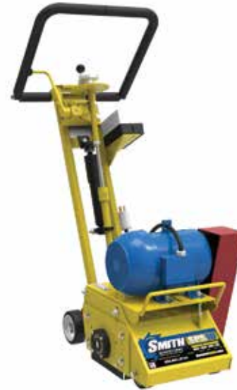
Smith 10" Electric Scarifier $395/Day $1185/Week $3555/Month

The SMITH SPS10™ is the world's most reliable electric powered scarifier on the market. Made in the USA by SMITH Manufacturing, the leading manufacturer of cutters and removal equipment, the SPS10 is #1 choice for the professional looking to remove-it faster, with better surface finishes.