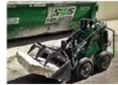
Pallet Forks $40/Day $120/Week $360/Month