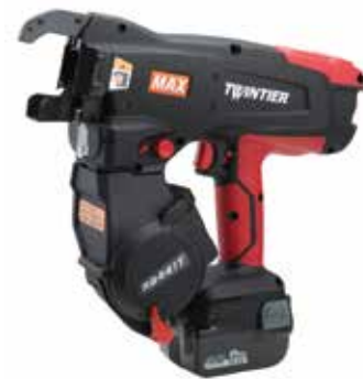
MAX Tool Rebar TwinTier RB441T $85/Day $255/Week $765/Month

Multipurpose construction laser for interior and exterior applications. Exceptional versatility allows it to handle a wide variety of horizontal, vertical and plumb applications. The HV101 laser transmitter is automatically self leveled in the horizontal and vertical planes and sends a continuous 360-degree laser reference over the entire work area. The HV101 laser is easy to set up and use and is rugged enough for the toughest jobsite.